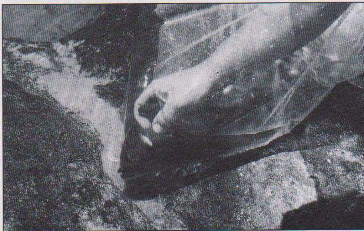
Finding a new home - translocating yellowfish in the Bushmans Kloof Game Reserve.