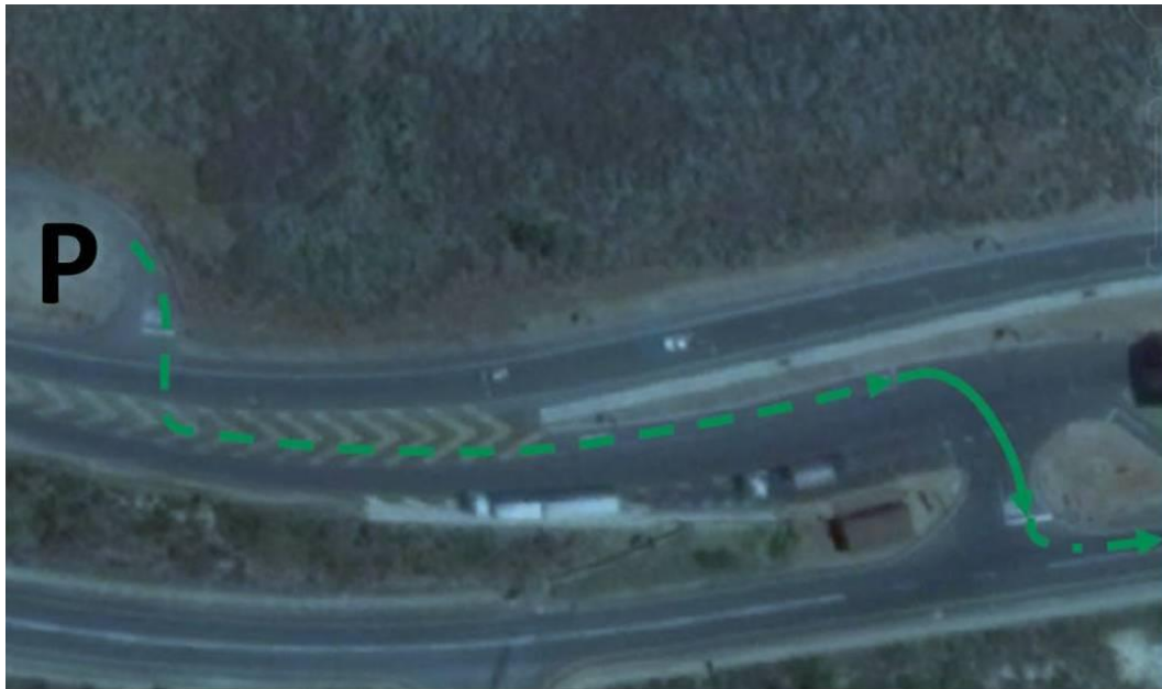
Figure 8. Directions to exit the parking (P) and head away from Cape Town on the N1. Exit the parking and cross the N1 onto the painted island. Stay left but to the right of the island stopping at the yield sign on the road (dashed arrow). Carefully cross in front of the weigh-bridge and stop at the stop street (solid arrow). Turn left onto the old pass road and follow the road back to the N1 (dot-dashed arrow)