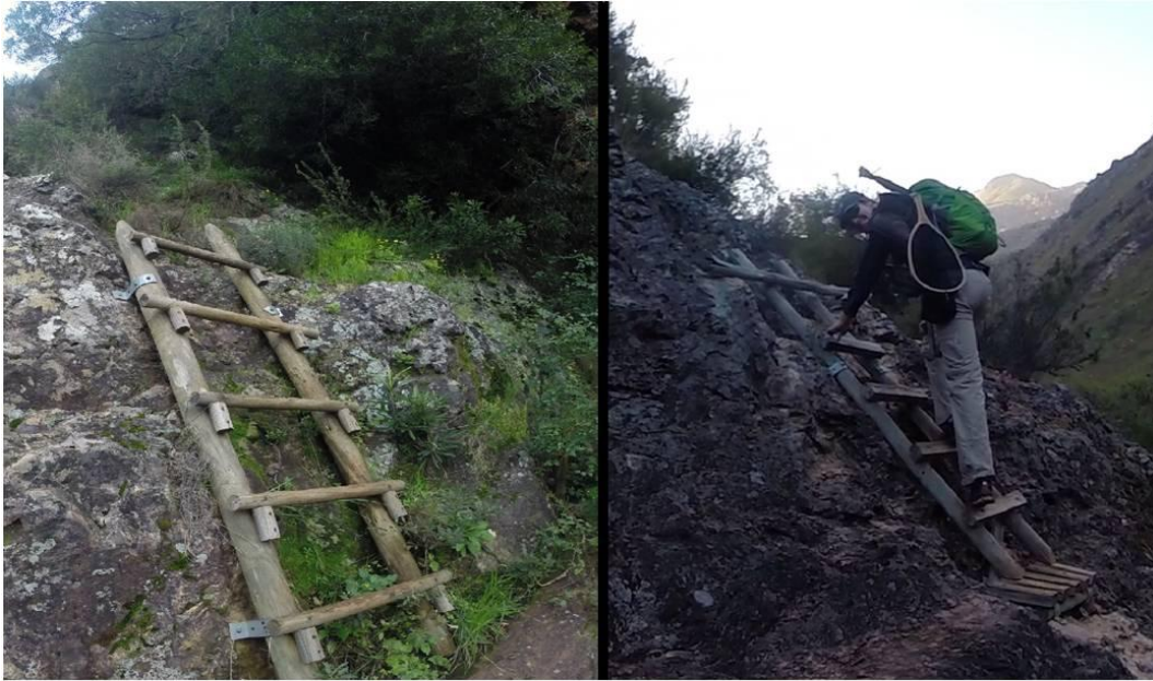
Figure 7. Two ladders on the Elandspad hiking trail. (left) The ladder closer to the N1, climb up the ladder to continue towards the N1. (right) The ladder further from the N1, above the start of Elandspad beat 2. Climb down the ladder to continue towards N1.