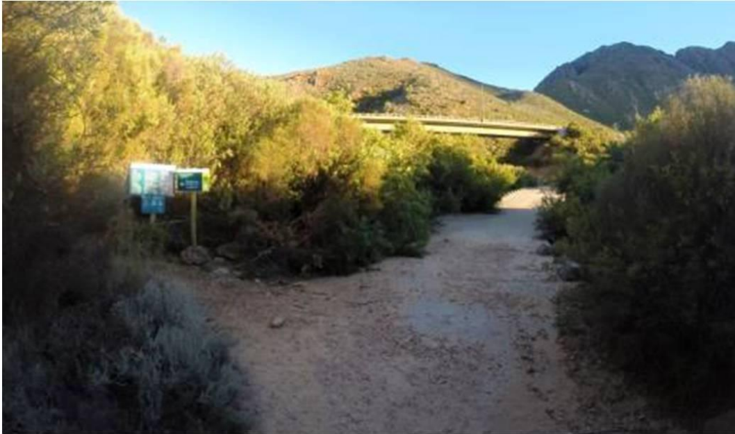
Figure 3. Sign showing the start of the Elandspad hiking trail. Follow the trail to the confluence of the Elandspad river and Smalblaar river.