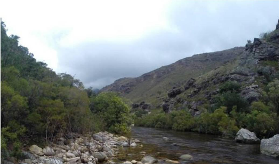
Figure 5. Long pool (70m) before the end of the beat (facing upstream). Many choose to end the beat at the downstream end of the pool as the hike out is a simple scramble up the left bank (facing upstream) to the hiking path.