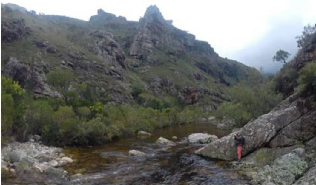
Figure 6. Looking DOWNSTREAM from the end of Elandspad One Beat.