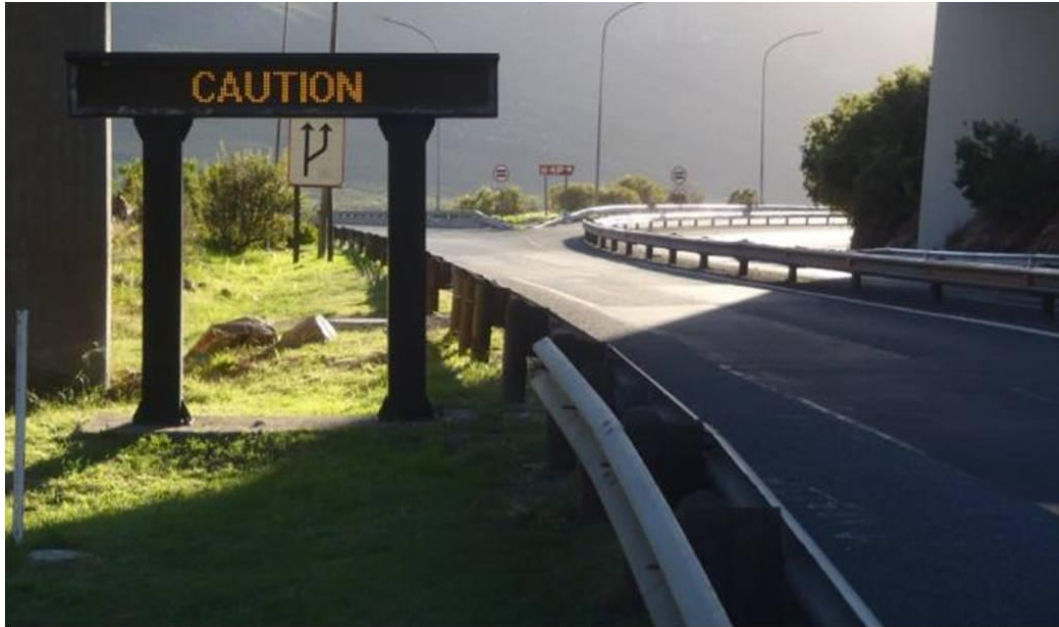
Figure 1. Turn off to the parking area for upper Smalblaar and Elandspad beats. The small side road starts as the N1 splits into two lanes soon after exiting the tunnel and passing under a large bridge. Keep to the right and slow down after exiting the tunnel.